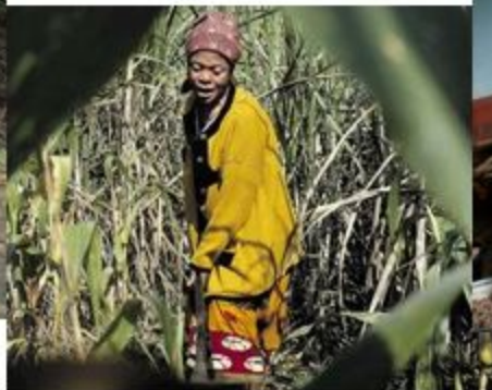
Sugar Cane (Jamaica)