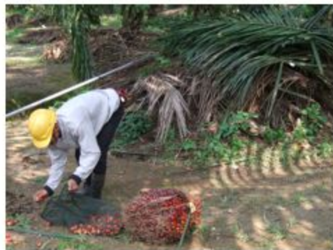
Palm oil (Malaysia) (Ghana)